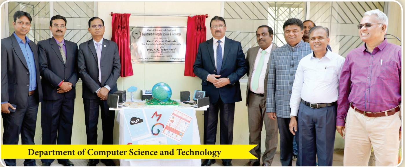
Department of Computer Science and Technology