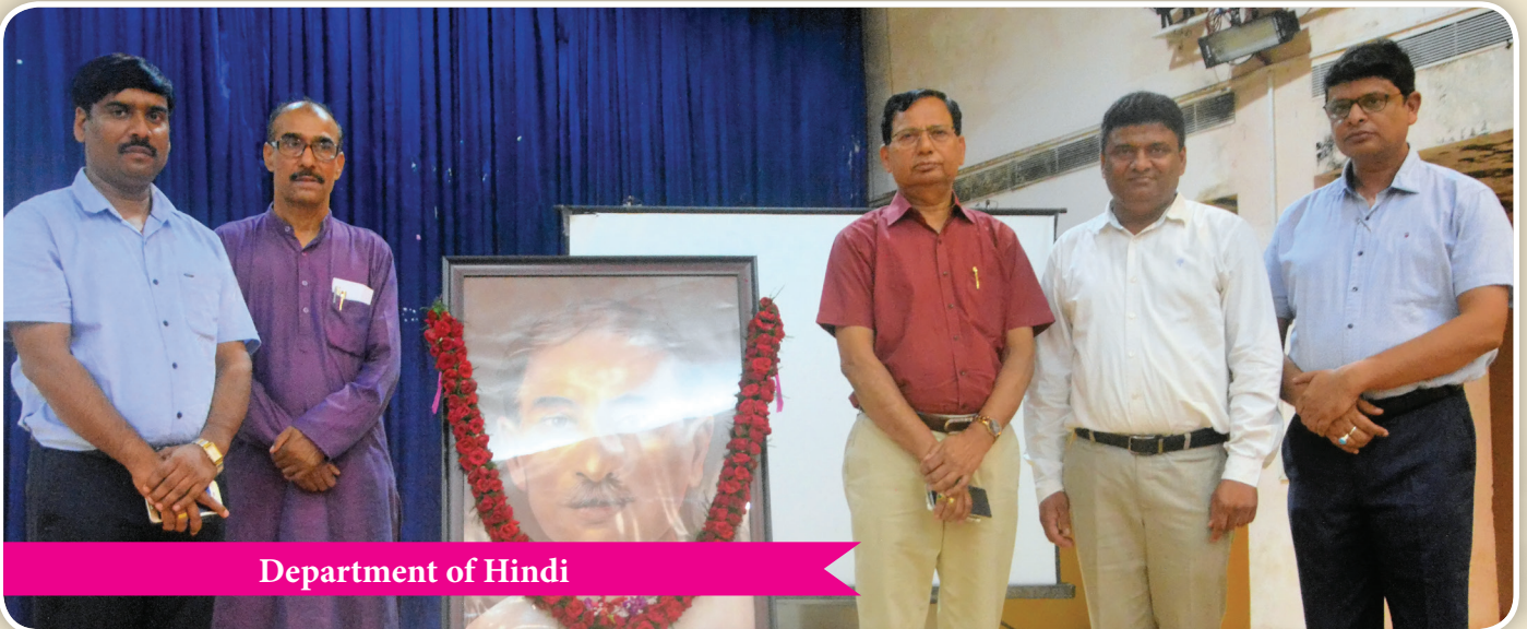
Department of Hindi