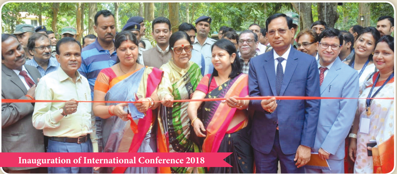
Inauguration of International Conference 2018