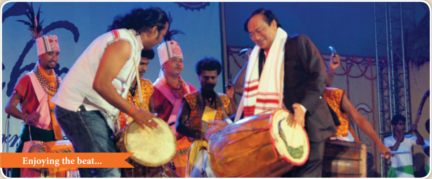
Enjoying the beat...