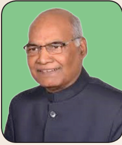
Visitor Shri Ram Nath Kovind Hon'ble President of India