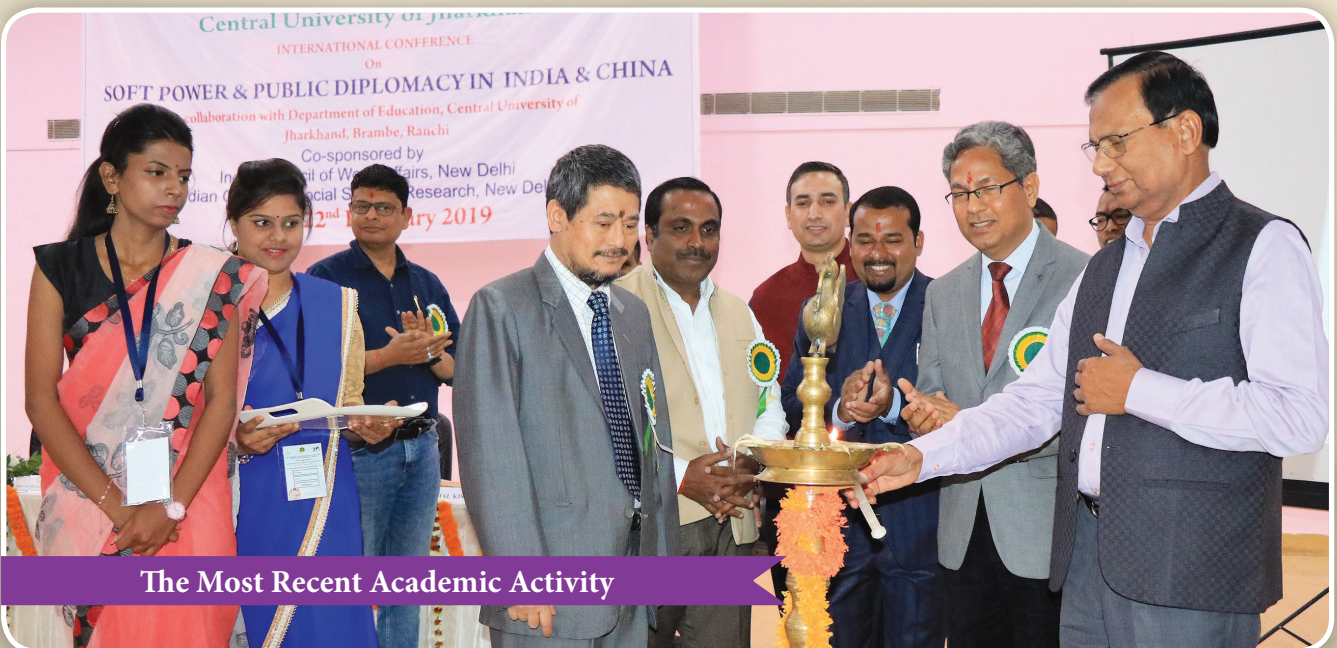
The Most Recent Academic Activity