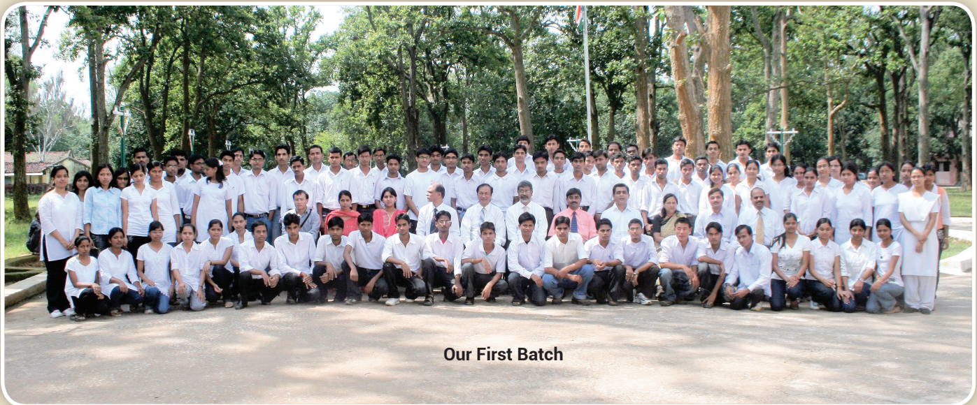
Our First Batch

First Student to be Awarded the Degree of Integrated Masters' Programme