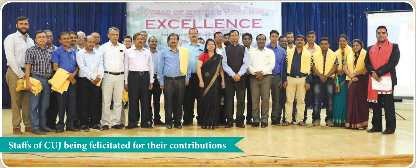
Staffs of CUJ being felicitated for their contributions