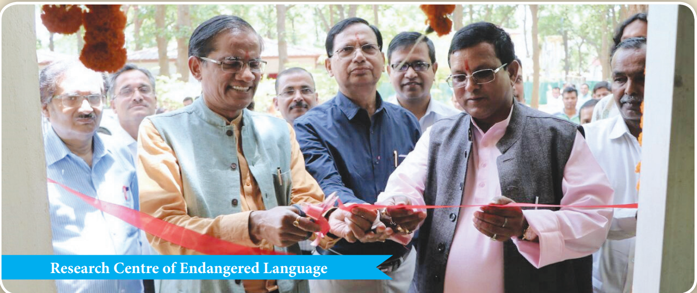
Research Centre of Endangered Language