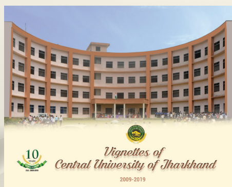
Coffee Table Book 1 st March 2009-1 st March 2019