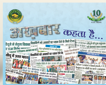
Coffee Table Book 1 st March 2009-1 st March 2019